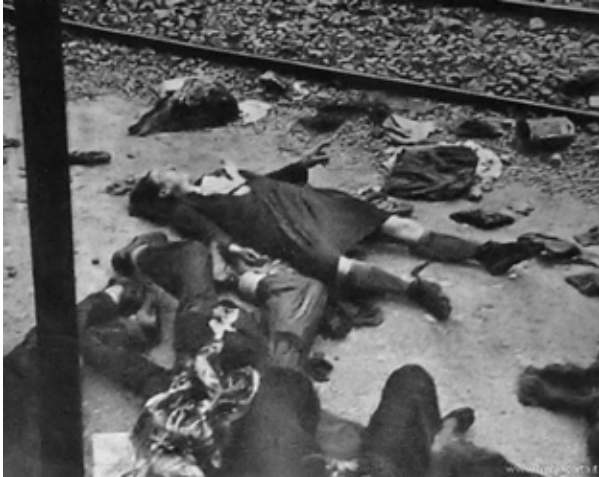
Figure 4. Dead passenger bodies alongside railway tracks.

The search party from Balvano arrived at the site four hours after the 8017 entered the Galleria delle Armi. They were unable to immediately pull the train from the tunnel due to the large number of corpses on the tracks and under the train (Figure 4). Bodies were found inside and outside the train. A few were alive. In the end, there were about forty survivors. Of the crew, the second brakeman from the caboose and the fireman of the second locomotive were the only survivors. The head engineer was found dead in his seat, hands still on the controls.