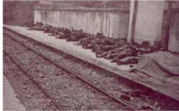
Figure 5. Bodies of people killed by carbon monoxide poisoning stacked on platform in Balvano train station.

from the train by police and military personnel and stacked on the station platforms (Figure 5). In all, there were 521 deaths from carbon monoxide poisoning. Many carried false papers or no identification at all, leading to the inability to identify 193 of the deceased. Due to the large number of bodies, the wartime lack of resources, the inability to identify many of the dead, and the poverty of many victims, they were hastily buried in a mass grave in the Balvano cemetery (Figure 6). Only the railroad crew received proper burials.