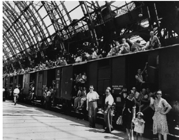
Figure 2. Nonticketed passengers riding the freight cars of an Italian train in 1944.

The 8025 arrived in Balvano just after 02:30 AM. It was decided to uncouple the locomotive and use it to search for the missing 8017. While uncoupling the locomotive, the brakeman from the 8017 caboose stumbled into view. Exhausted from the route he had just traversed on foot, he cried, "They are dead. They are all dead."