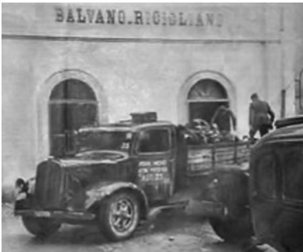
Figure 6. Bodies being loaded for transport to Balvano cemetery for mass burial.

After bodies were cleared from the tracks and beneath the train, the locomotive of 8025 pulled the 8017 backward to Balvano. Bodies were removed